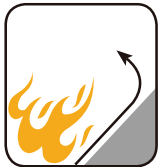
Reduced Fire Propagation NF C32-070-2.2(C1) IEC60332-3-24 EN50266-2-4