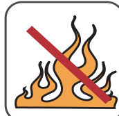
Fire Resistance IEC 60331 /NF C 32070-2.3(CR1)