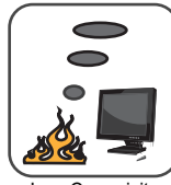
Low Corrosivity IEC60754-2 EN50267-2-2/3 NF C 32-074