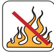
Flame Retardancy NF C32-070-2.1(C2) IEC60332-1-2/EN50265-2-1