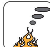
Low Smoke Emission IEC 61034-1&2 EN 50268-1&2/NF C32-073